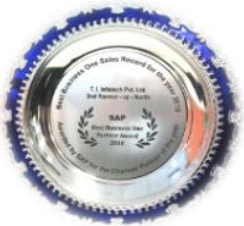
Best Business One Partner Award