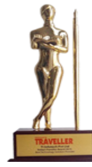
Best Technology Solution Provider 2015 By North India Travel Award